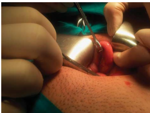
Appendix vermiformis. Note distal tip is inflamed revealing flegmonous appendicitis.

adjacent to fallopian tubes it is referred to as PTC. Most reported cases of PTCs have occurred in pediatric patients [4]. It has been hypothesized that PTCs increase in size with hormonal activity [5]. Larger lesions may become symptomatic, causing pressure or pain. An association between PTCs and obesity has been suggested [6]. Our case was not considered to be obese and she was in the normal range for weight and height percentile. PTCs usually consist of either unciliated epithelium, ciliated cuboidal epithelium, or ciliated columnar epithelium [7,8]. Inside the cyst in our case there was serous fluid and the epithelium was of ciliated columnar type.