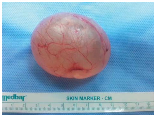
PTC after enucleation.