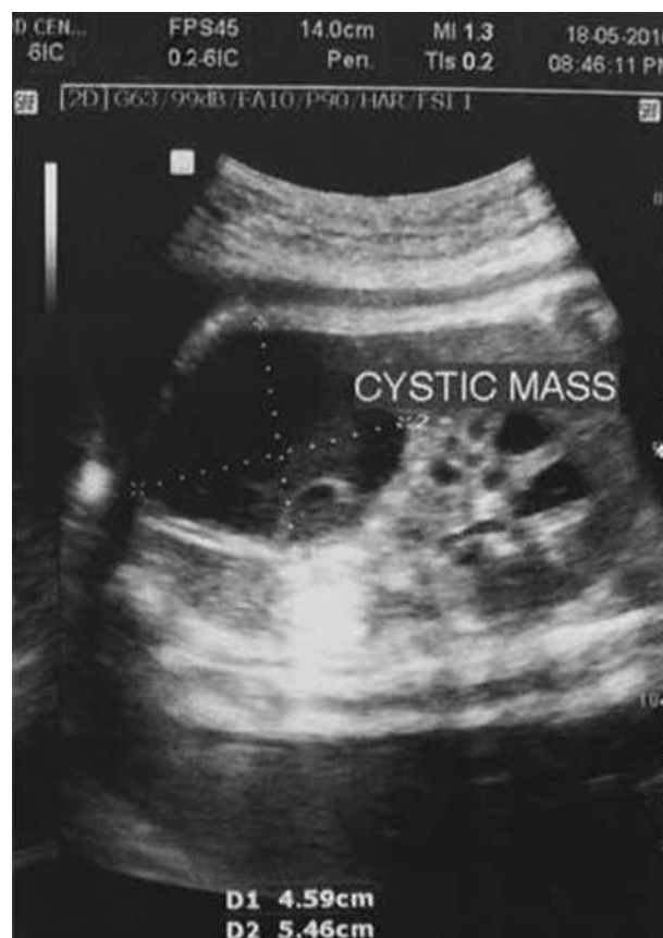
Antenatal ultrasound showing the cystic lesion.