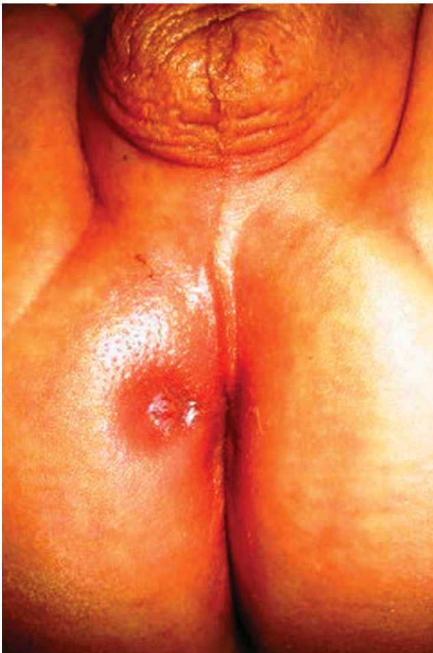
FIA: external opening. FIA, fistula-in-ano.