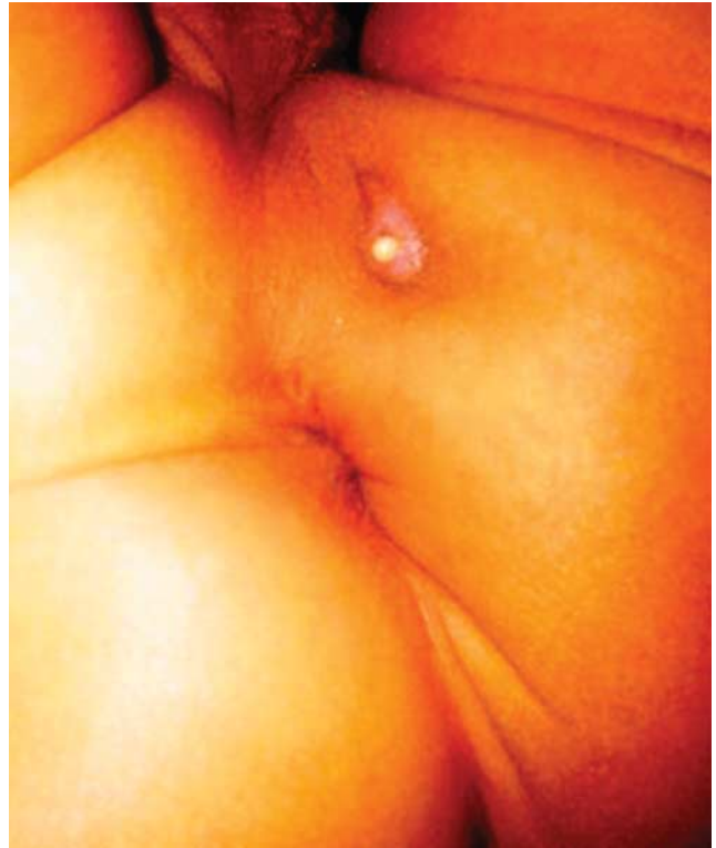
Presentation with purulent discharge.