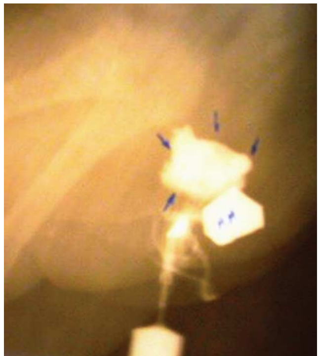
Fistulogram: low FIA. FIA, fistula-in-ano.