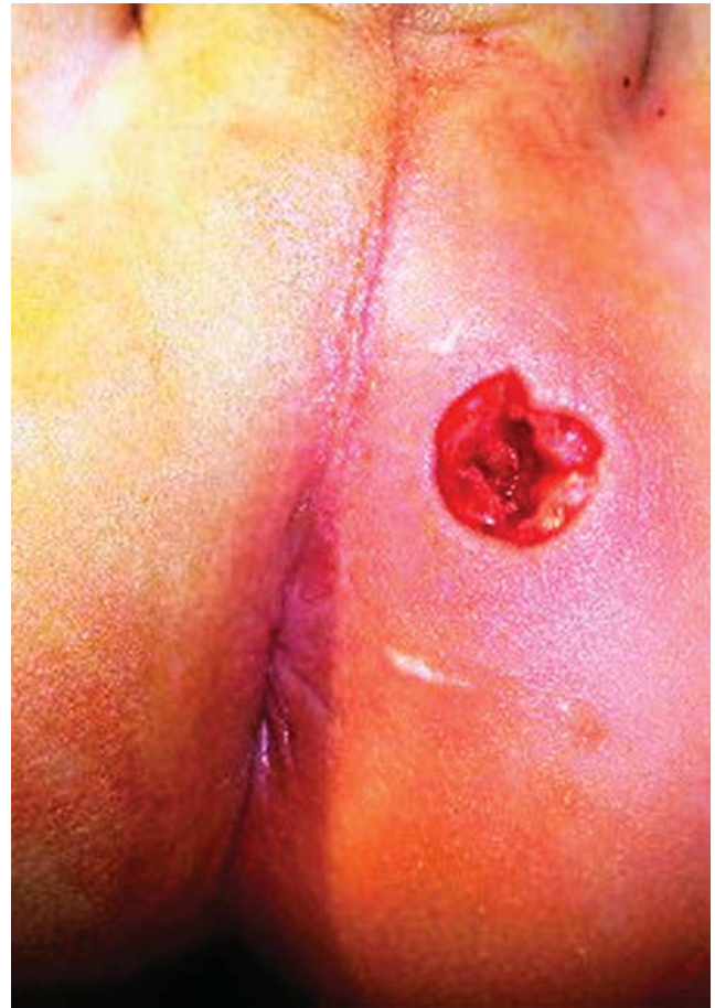
Fistulectomy: postoperative wound.

postoperative day. Babies were given a brief warm bath after every bowel movement to ensure local hygiene. The wound was cleaned and lightly packed with gauze soaked in povidone iodine 10% or native honey to allow gradual filling of the cavity by granulation tissue; thus, the wound was allowed to heal by secondary intention.