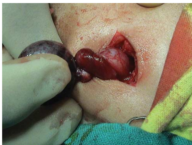
A case of extravaginal testicular torsion showing twist of the spermatic cord.