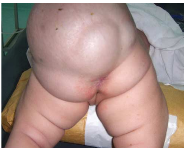
Large sacrococcygeal teratoma.