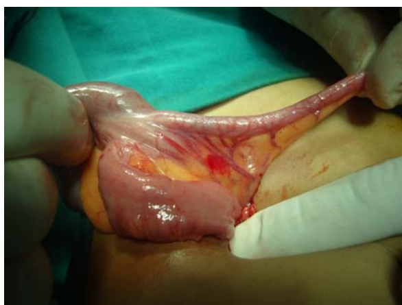
Fig. 2: Appendix length is assessed