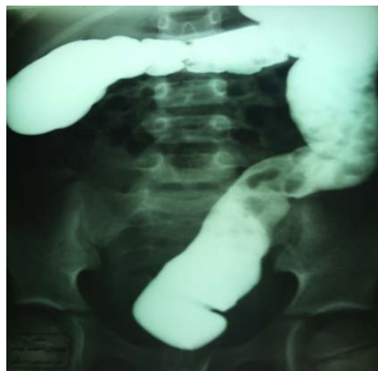
Fig. 4 B: Barium enema six month after ACE