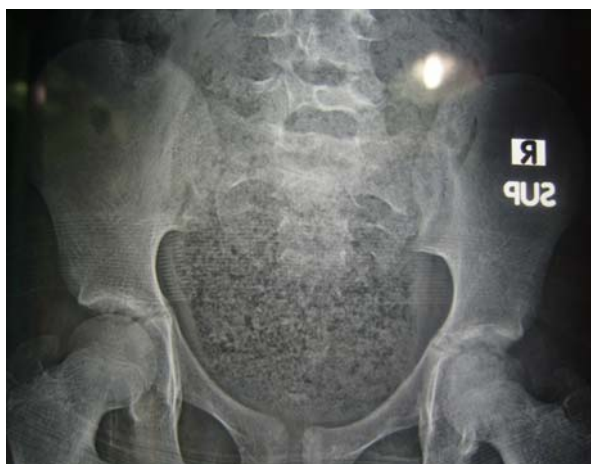
Fig. 1 A Plain X-ray showing fecaloma in the rectum