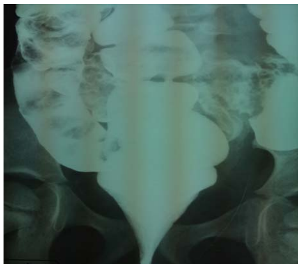
Fig. 4 A: Barium enema showing mega rectum before ACE