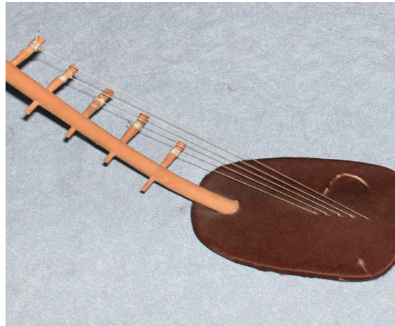
Figure 1: Authentic 5-stringed Adeudeu of the Teso

Adeudeu is a principal instrument of the Teso community that gives the neighbourhood its cultural identity. It is a harp (see figure 1).