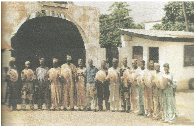
The standing Position of the Performance of Dundun Sekere Ensemble

The role of court music in various ceremonies such as 'Jimoh Oloyin (Special Friday), Month of Ramadan fasting, the eve of every El-del-Fitri festival, Bere festival, funeral, marriage, naming, coronation, dethronement, social homage, inter-ethnic wars, announcement, news agency, and so on cannot be over-emphasized.