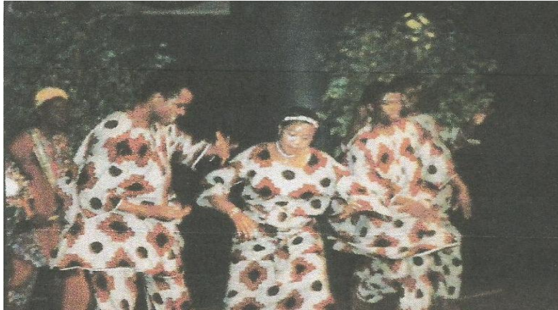
Dundun Sekere Dancers