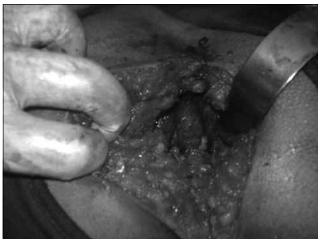
Figure 4: Cavity after removal of sinus

Histopathology of excised specimen revealed it to be a case of epidermoid cyst lined with stratified squamous epithelium. No recurrence was noted after 2 years of follow-up.