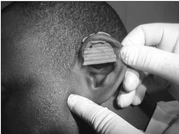
Figure 1: Corrugated rubber drains used as stitch dress