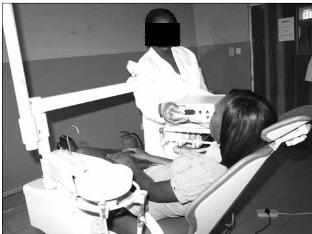
Figure 3: Halimeter in use

less than 181 ppb. Nineteen subjects with periodontal disease had concentration of VSC between 181 and 250 ppb, and 17 subjects with periodontal disease had concentration of VSC greater than 250 ppb ( P = 0.01 ) [Table 3]. The mean concentration of VSC concentration was reduced to 46.6 (3.2) ppb and 106.2 (9.5) ppb in the group with no periodontal disease and the group with periodontal disease, respectively [Table 1].