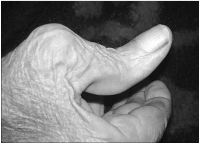
Figure 1: Diabetic cheiroarthropathy or stiff hand syndrome

neglected until hand deformity is severe enough to interfere with daily life.