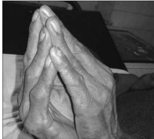
Figure 2: The preacher's sign involves the patient holding the hands opposed to one another vertically with elbows flexed and wrists extended. A positive sign is indicated by an inability of the patient to completely approximate the palmar surface of the digits

Since only few studies have been reported from India that compared rheumatic manifestations in a cohort of diabetic patients with control group, one such effort was made by Sarkar, et al. [4] The characteristics of diabetic foot disease are well documented in India; henceforth it would be appropriate to evaluate the problem of diabetic hand syndrome in this environment, and an attempt to characterize the relevance