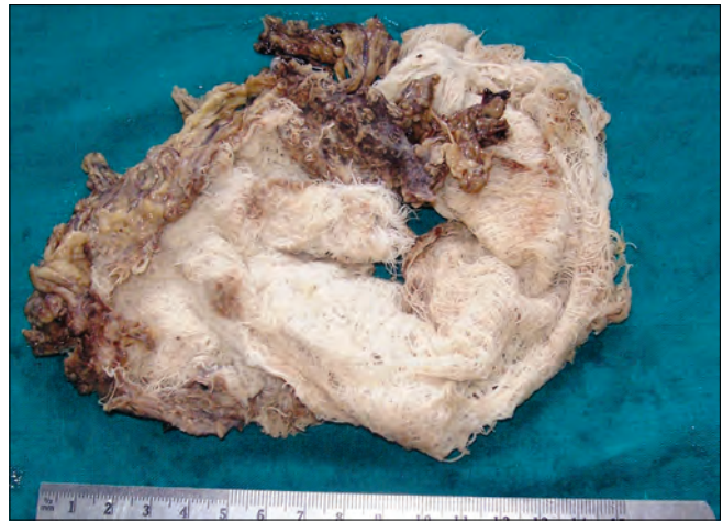
Figure 1: Photograph showing the specimen of gossypiboma - gauze adherent to omentum

A study reported that emergency surgery, unplanned change in the operation, and body mass index were statistically significant risk factors for retained foreign bodies. Surgeons should place radiologically detectable sponges and towels in