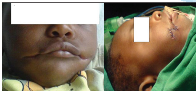
Figure 1: Baby sleeping (pre op)