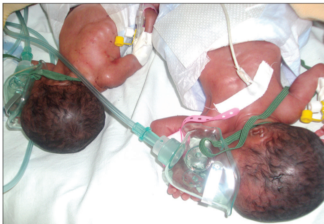
Figure 1: Diamniotic–dichorionic twins; first day post delivery admitted at Bugando neonatal unit

Fourteen days after discharge, the patient was readmitted with peritonitis which necessitated repeat laparotomy and attempt to remove the placentas provoked massive hemorrhage which was controlled by intra-abdominal packing and the patient was transfused with 3 units of blood. The abdominal packs were removed after 48 hours with no active bleeding from placental site. Eight days after removing the packing, the patient developed fascial dehiscence and was taken to operating room for exploration, where both placentas were easily detached without provoking bleeding. Her postoperative recovery thereafter was unremarkable, and she was discharged to attend outpatient clinic. After three visits of 11 months, she was discharged from the clinic in a good condition.