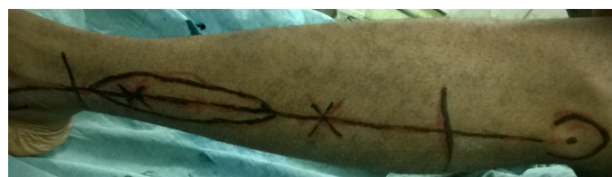
Figure 2: Potential skin paddle outline

Intraoperatively, patient underwent standard physiological