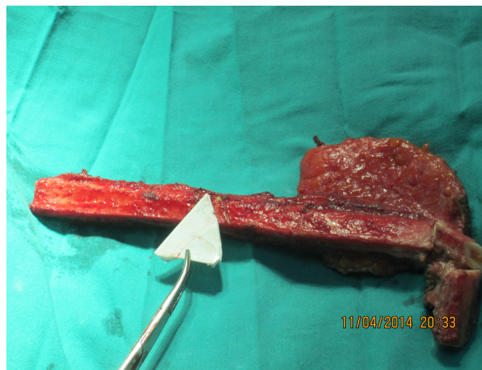
Figure 3: Harvested VFF