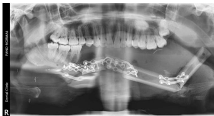
Figure 7: This panoramic view of VFF for mandibulectomy LCH (Case 2). Consideration for the use of a VFF with condylar implant

With respect to pre-surgical studies, while the consensus on peroneal assessment is magnetic resonance angiogram, the cost of this makes it difficult to achieve in less opportune