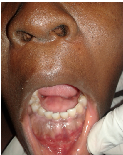
Figure 1: Anterior mandibular swelling; intraoral view (Case 8)

Data collated included; demographic data, histopathology, types of mandibulectomy, defect classification, types of vascularised fibula flap reconstruction, bone and pedicle length with or without skin paddle dimension, tourniquet and ischaemic time, overall surgery time, flap outcome, clinical outcome and complications following reconstruction.