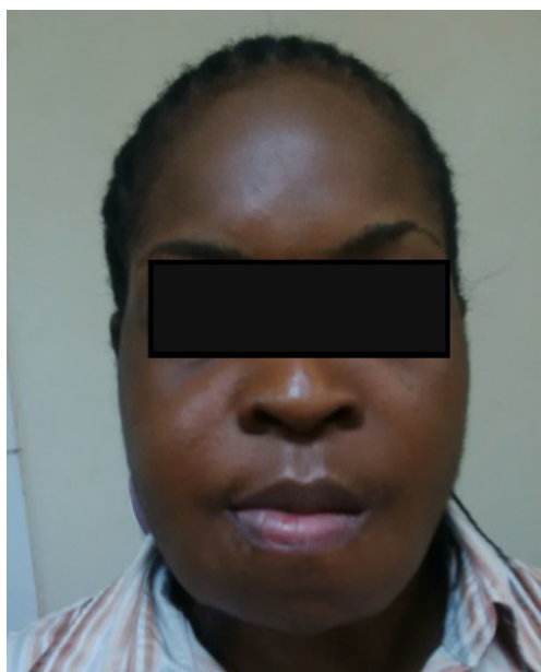
Figure 5: Post-operative (Case 8)

Flap outcome was evaluated periodically over 12 months, post reconstruction [Figure 5 and 6]. Vascularised fibula flap was adjudged successful when a postoperative panoramic image showed complete consolidation of the bone graft [13]. Clinical outcome was evaluated based on adequate mouth opening and swallowing. It was adjudged "excellent" or "good" when no alteration in mouth opening or limitation during swallowing occurred. It was considered "acceptable" when mouth alteration and swallowing limitations were mild to moderate. It was "poor" when mouth alteration and swallowing limitations were significant. Aesthetic outcome were classed "good" when surgeon and patient did not find any alteration to site of reconstruction, "acceptable" when alterations were mild to moderate and "poor" when alterations were significant [14].