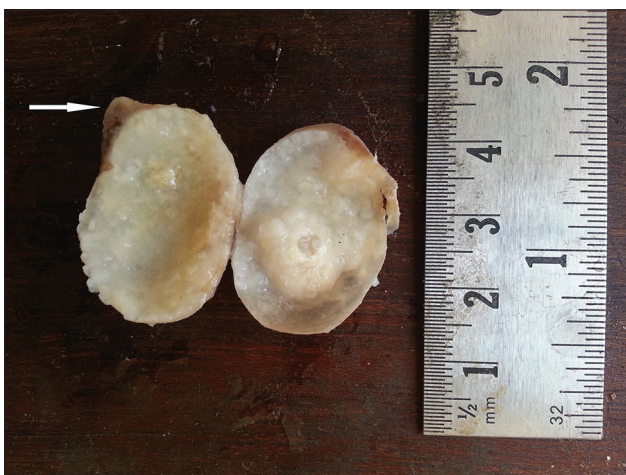
Figure 1: Grossly, cut surface of lymph node showed a cyst filled with whitish creamy material and a gray-brown solid area (? node) (marked by arrow)

Detailed morphological evaluation of lymph nodes is crucial in reaching at an accurate diagnosis as these inclusions may be misinterpreted as tumor metastasis. The criteria favoring benign inclusions include bland nuclear cytology, absence of anaplasia, brisk mitosis, and necrosis.