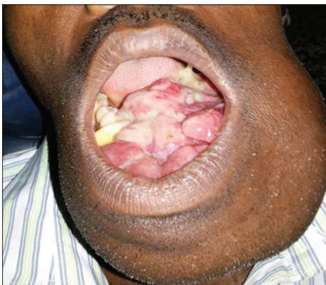
Figure 2: A case of squamous cell carcinoma of the floor of the mouth