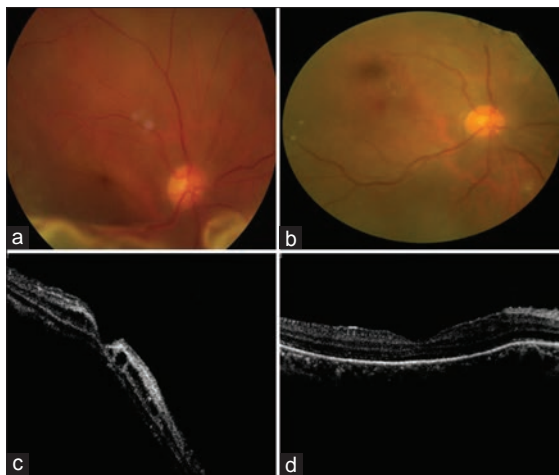
Figure 1: (a) Detached retina at presentation (b) retina well settled postscleral buckling surgery at 2 weeks (c) optical coherence tomography at presentation (d) optical coherence tomography postscleral buckling at 2 weeks

RD could be treated either by carrying out scleral buckling or doing pars plana vitrectomy and silicon oil/gas tamponade. Management of RRD, in pregnancy needs special consideration as both patients were one-eyed and any delay in surgery would alter the visual prognosis, and at the same time managing such patients without causing any harm to their pregnancy and fetus. The questions on our mind were (1) type of anesthesia (2) posture during surgery (3) posture following surgery (4) safety of medications in pregnancy (5) to provide them vision as early as possible.