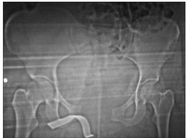
Figure 2: Pelvic X-ray in anteroposterior view showing the pubic symphysis disruption with 8cm widening. There were no sacroiliac joints widening and vertical instability