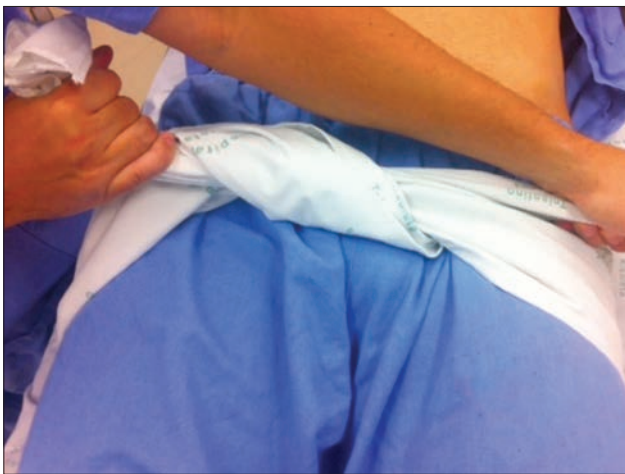
Figure 4: A circumferential pelvic binder was applied at the great trochanter level to perform pelvic ring closure

Although some authors advocate that a gap >1.0 cm with concomitant anterior ligaments disruption is pathological and provides pelvis instability, the standard treatment for anteroposterior compression Type I (pubic symphysis diastasis <2.5 cm) remains conservative. Bed rest until pain relief and progressive weight bearing after at least 4 weeks are indicated. [15] In addition, postpartum pubic symphysis disruption with <4.0 cm tends toward original