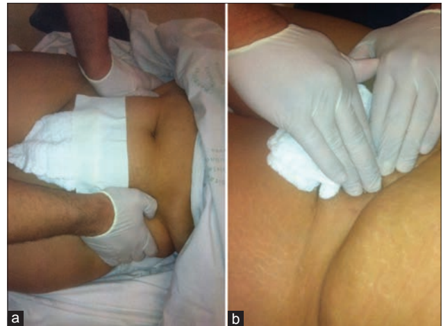
Figure 1: (a) Iliac crest compression to verify pelvic ring stability. (b) Pubic symphysis palpation investigating for diastasis between pubic rami

Injury mechanism of intrapartum pubic symphysis disruption is a rapid and forceful descendent pressure of the fetal head