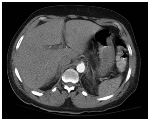
Figure 2: Repeat computed tomography scan revealed near complete resolution of the portal venous gas and mesenteric venous gas

Many different etiologies have been reported to cause HPVG, and the mortality rate depends on the cause of HPVG. [1,3] Up to 75% of mortality rates have been reported when bowel ischemia is the cause of HPVG. [8] There is a decline in mortality rate in different case studies from 75% to 29% for HPVG when there is early recognition of HPVG by frequent use of imaging studies followed by early intervention of underlying etiology. [7,9-11] The possible reason for the gas in the portal vein, in our patient, was an impaired colonic mucosal barrier caused by transient mesenteric ischemia induced by cocaine-mediated vasoconstriction. The pathophysiology of HPVG is an intricate process in which two or three situations are combined. Our