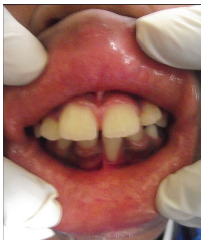
Figure 1: A deep overbite and localized gingival recession of the labial gingiva of tooth 31 in a healthy mouth

The closing pattern of the child-patient recorded on Video (video 1) shows a right shift of the midline on closure. Premature contacts between teeth 32-21 and teeth 11-41. Tooth 31 appeared spared in the video recording but close observation of the child-patient prior to this video recording had revealed a bruxism habit related to the tooth.