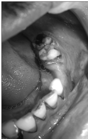
Figure 3: lower left first and second premolars as well as lower left canine were missing. Neither any swelling nor any pus discharge was present intraorally

Orthopantomogram showed multiple (three) radiolucencies in the mandibular throughout the length of the mandible along with impacted third molar and canine on the right