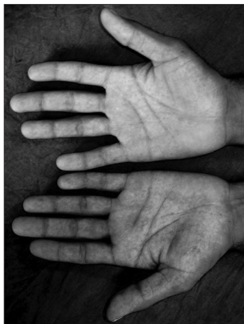
Figure 2: Palmer pits in both hands