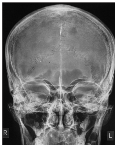
Figure 5: Postero-Anterior skull with calcification of Bilamellar falx cerebri

Multiple OKCs usually occur as a component of NBCCS or GGS, Oro-facial-digital syndrome, Noonan syndrome, Ehler-Danlos syndrome, Simpson-Golabi-Behmel syndrome. [8] In our case, clinical and radiological features were not in concordance with any other syndromes except GGS.