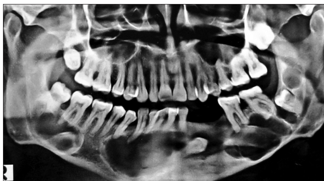
Figure 4: Orthopantomogram with multiple multilocular radiolucent lesions in the maxilla and mandible

Clinically this condition is characterized by different signs and symptoms. Diagnosis is based on the most frequent and specific features of the syndrome as given by Evans et al. in 1993. [5] Diagnosis of GGS can be established when two major or one major and two minor criteria are present. [5-7]