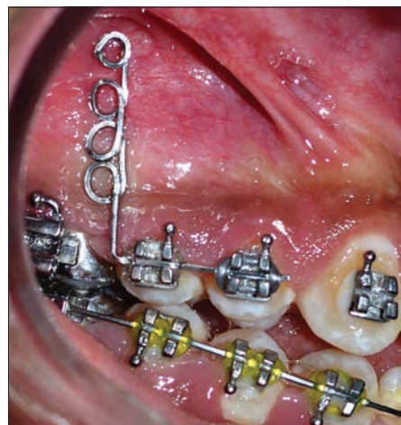
Figure 4: Clinical applications

The technique mentioned in the present article is simple and accurate because the implant is inserted through the helix of the guide, hence less chance for it to be misplaced. The existing