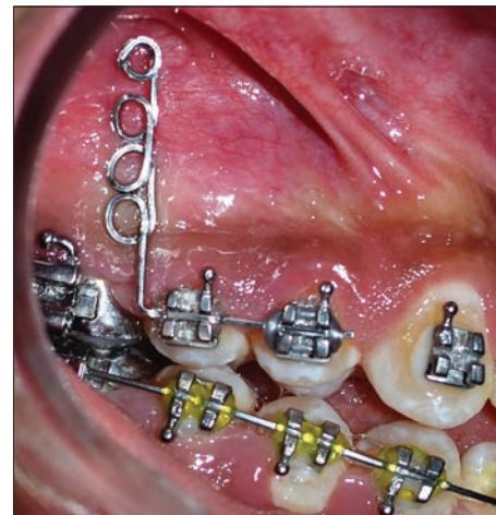
Figure 4: Clinical applications

is reconfirmed clinically [Figures 3 and 4]. A periapical radiograph is taken to confirm the correct position of the helixes for the mini-screw insertion the intraoral periapical radiograph here shown was taken by cone-beam paralleling technique.