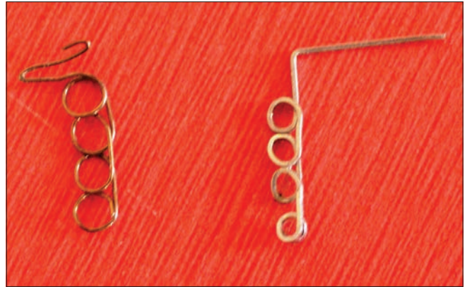
Figure 2: K.S. micro-implant placement guide