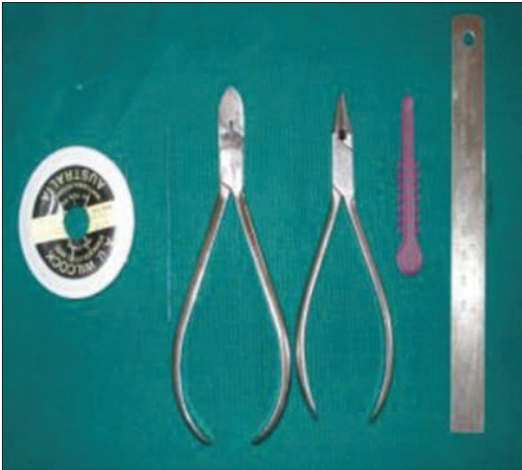
Figure 1: Explains fabrication armementarium