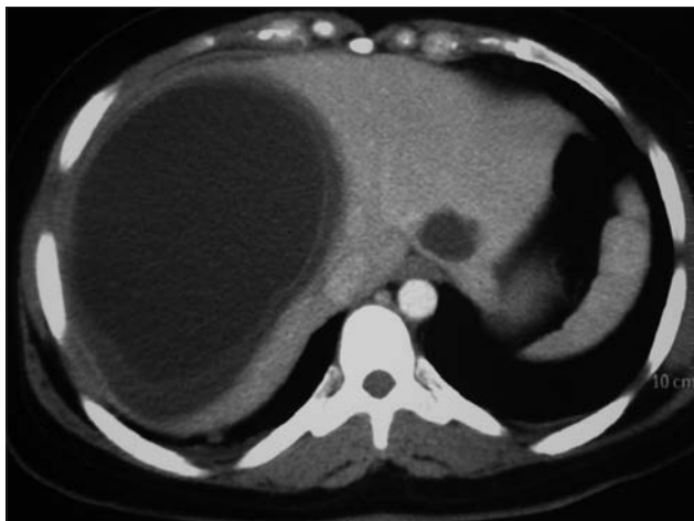
Figure 1: Computed tomography scan demonstrating large homogenous liver cyst