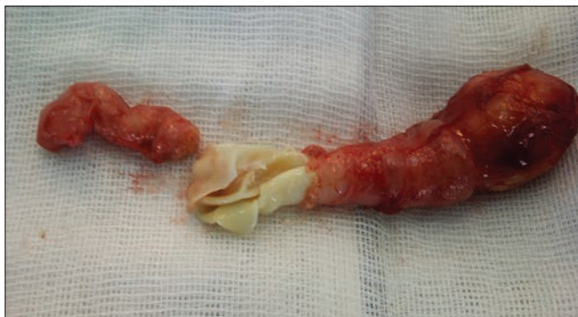
Figure 3: Excised fallopian tube containing a hydatid cyst

happen and can be the presenting feature of hydatid cyst. It is highly probable that previously diagnosed pelvic abscess in our patients was a superinfected hydatid cyst in the left adnex.