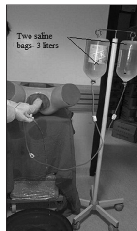
Figure 2: Trans-urethral resection of prostate set being connected to large saline bottles and regulators made open so there is egress of saline