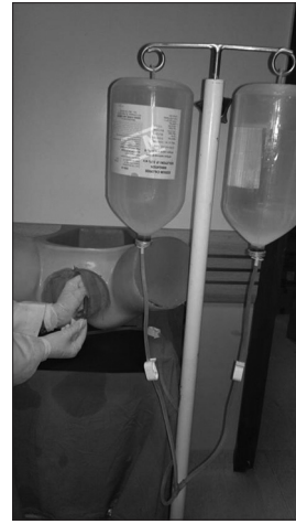
Figure 4: This figure shows complete procedure being done

Once the diagnosis of inversion is made, measures should be undertaken to manage and correct acute blood loss and potential shock. In conjunction with anesthesia personnel, immediate uterine replacement should be considered. Immediate recognition and early treatment to relax the cervico-uterine junction should ensure rapid replacement of the uterus. Manual repositioning of uterus under anesthesia is immediately recommended, [2] if there is a delay in anesthesia and patient is in profound shock (or even if the manual replacement has failed), O'Sullivan's hydrostatic replacement technique can be remarkable and is gratifyingly effective and is to be undertaken. [6-8] If done properly is always successful and it avoids the risk of anesthesia and reduces maternal morbidity and mortality. The challenge in O'Sullivan's method is in developing a water seal. Use of 1 L bags of warmed saline with a pressure infusion pump is usually recommended, but small saline bottles need to be replaced quickly and to create pressure by pump requires a longer time. Some workers have modified this technique by attaching the tubing to a silastic vacuum extractor cup, which is placed inside the introitus and might help provide a better seal. [9] We modified this technique by using a trans-urethral resection of prostate set (TURP set), used in endoscopic resection of prostate and two 3 L warm saline bags with success.