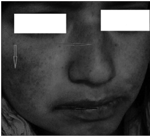
Figure 1: Clinical photomicrograph showing Dark brown rash over face (red and green arrows) and dark pigmentation over lips (black arrow)

steroids. Serum antiadrenal antibody test showed results as 3 U/ml (normal range < 1 U/ml). Patient showed dramatic improvement in clinical parameters and hemodynamics. Morning cortisol levels were 7.5 µg/dl (normal range > 15 µg/dl). A short synecthen test (SST) using 250 mcg synecthen carried out after stopping steroids showed 30 min value of 10 µg/dl and 60 min value of 12 µg/dl. Computed tomographic scan of the abdomen was normal. Thyroid function test was normal. Antithyroid peroxidase antibody levels were normal.