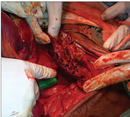
Figure 1: Intra-operative on table view of multiple perforations

In our case report, patient was a middle aged Indian male; enteric perforation is more common in middle aged male because they are more exposed to infection as they consume food outside, which may be unhygienic. [10] Traditionally, diagnosis is made mainly on the basis of clinical history and examination, X-ray abdomen, and ultrasound abdomen supported our diagnosis.