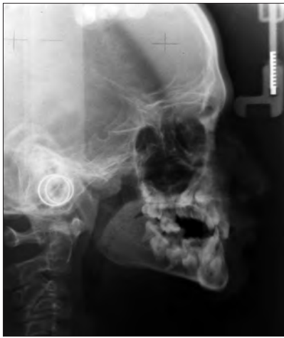
Figure 5: Lateral cephalogram showing skeletal class I malocclusion with orthognathic maxilla and mandible associated with horizontal growth pattern and retroclined upper and lower anteriors

provisional diagnosis of Noonan's syndrome was established after ruling out other differential diagnosis.