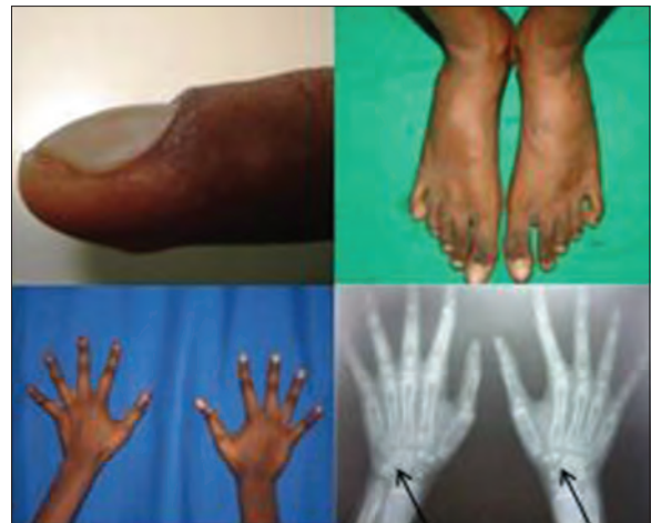
Figure 2: Photograph showing arachnodactyly and clubbing of nails; hand wrist radiograph revealing a missing carpal bone with no fusion of the present carpal bones

The differential diagnosis includes William's syndrome, Leopard syndrome, fetal alcohol syndrome, and Aarskog syndrome. [4,5] The absence of cardiovascular abnormalities in our patient has ruled out the possibility of William's syndrome. [6] The absence of maternal alcohol consumption during pregnancy and lack of central nervous system abnormalities that are the cardinal features of fetal alcohol syndrome excludes it from the diagnosis. [7] The present case could not be attributed to Aarskog syndrome due to lack of digital and genital findings. [1] The presence of only one cardinal feature of Leopard syndrome that is, ocular hypertelorism in our patient excludes it from our diagnosis. [1] The dental anomalies in the present case are closely associated to that of cleidocranial dysplasia, but the lack of skeletal anomalies affecting the skull and clavicle eliminates it from our diagnosis. Based on the clinical and radiographic features observed a