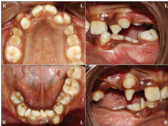
Figure 3: Intraoral views showing multiple submerged and retained deciduous teeth (53, 54, 55, 63, 64, 65, 73, 74, 75, 84, 85) and unerupted permanent teeth (12, 14, 15, 22, 24, 25, 33, 34, 35, 43, 44, 45, 46)

Mandibular right first permanent molar (46) was impacted and exhibited divergent roots [Figure 4]. Cephalometric analysis confirmed skeletal class I malocclusion with orthognathic maxilla and mandible associated with horizontal growth pattern and retroclined upper and lower anteriors [Figure 5].