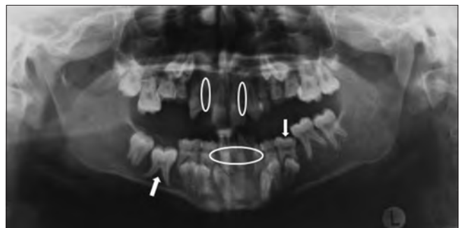
Figure 4: Orthopantomogram exhibiting three supernumerary teeth in relation to lower anteriors, congenitally missing (12, 22, 38, 48) and impacted permanent teeth (14, 15, 24, 25, 33, 34, 35, 43, 44, 45, 46). Mandibular right first permanent molar (46) was impacted and exhibited divergent roots