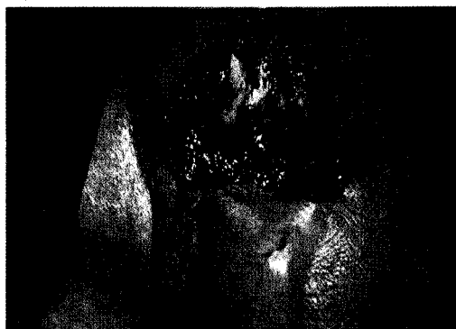
Fig 1: Flap of pubic bone reflected cephalad and held in place with a nylon suture. Note the ample working space