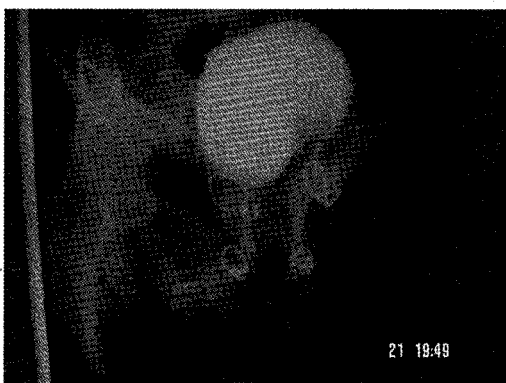
Fig 3: Free retrograde flow of contrast medium through false passage into bladder.

Repair entailed careful dissection and excision of the dense hematoma-fibrosis (result of organized hematoma and extravasated urine) until the proximal and distal ends of the distracted urethra identified by the passage of dilators became supple and mobile. Any malalignments were corrected and the blind distracted ends of the urethra were opened, spatulated and anastomosed end-to-end around a 14F or 16F Foley catheter, using 3-0 to 5-0 coated vicryl (polyglactin 910) sutures. The pubic bone flap was wired back in place and the wound closed with a drain to the repair site (Fig. 2). All the patients were given adequate antibiotic cover based on urine culture and sensitivity reports. Peri-catheter urethrograms were obtained 3 weeks post-repair and if no extravasation occurred the catheters were removed. The patients were followed up for between 1 and 4 years.