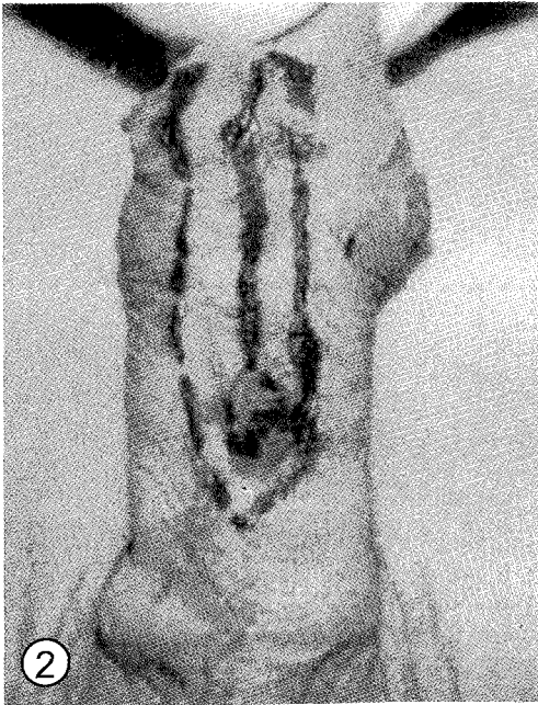
Fig. 2: Incision lines in a re-operation case