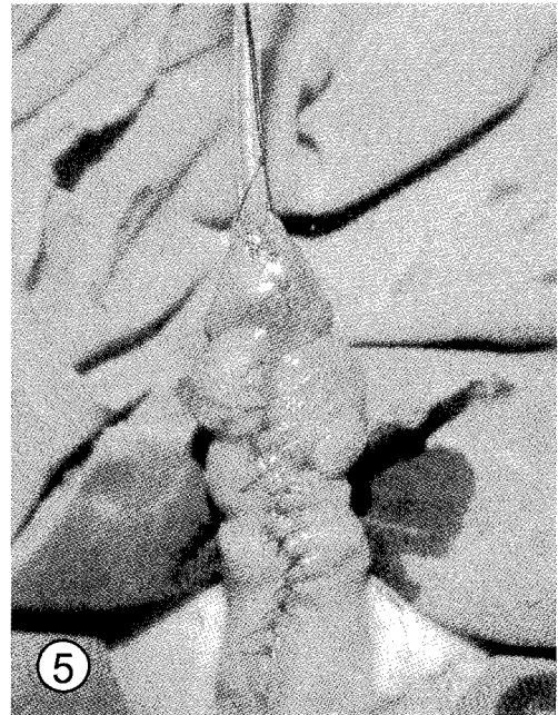
Fig. 5: Final repair in a re-operation case

urethral plate is then incised at the midline (Fig. 3) and tubularized around a stent (Fig. 4) with the stent size ranging from 8 to 10 Fr. depending on the patient's age and the size of the proximal urethra. An adjacent subcutaneous tissue flap, a dartos flap dissected from the scrotum or a tunica vaginalis flap is used as a second layer of vascularized coverage to augment the neourethral suture line. The skin is then closed and a mucosal collar is done (Fig. 5). The urethral stent is removed 7 or 8 days following the procedure.