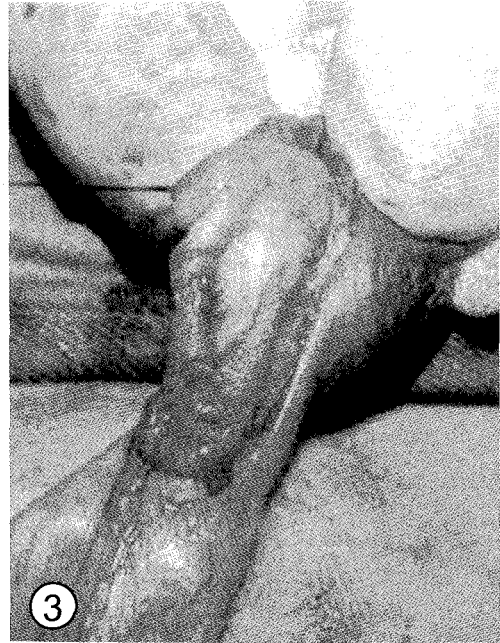
Fig. 3: Incision of the urethral plate in a re-operation case