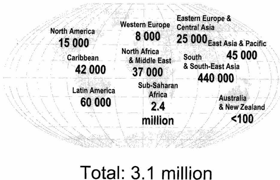
Fig. 2: Total number of deaths from HIV/AIDS during 2002 (data provided by World Health Organization)

people. This synergy between a disease of antiquity and a novel human pathogen has led to a resurgence of TB, especially in developing countries. Up to 70% of TB patients are infected with HIV, and up to 50% of people living with HIV can be expected to develop TB. Currently, TB is the commonest cause of HIV related death in many HIV affected areas.