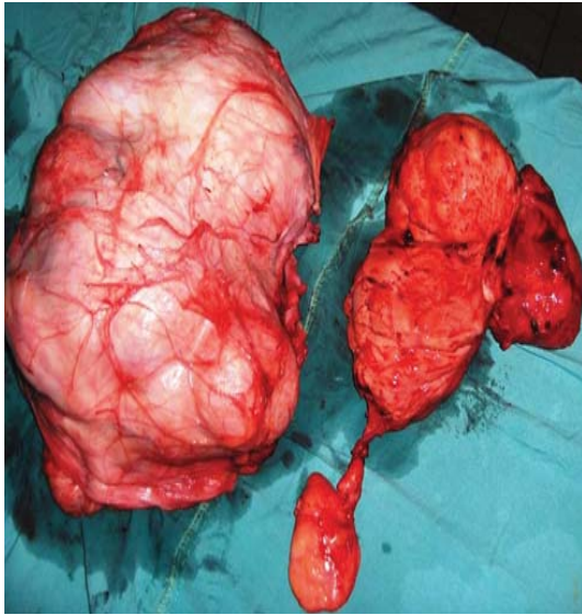
Figure 1: Surgical specimen consisting of a large tumor adjacent to the left testicle.