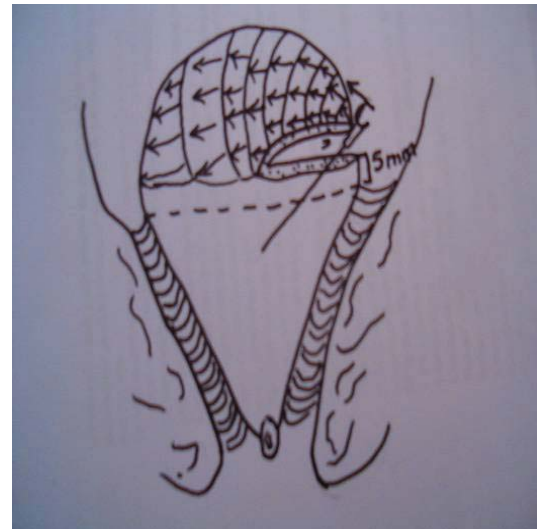
Fig. 3: Resection of the floating part is followed by resection of the fixed one.