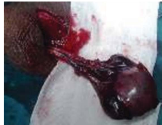
Fig. 2C: Delayed Gangrenous testis (non-viable).