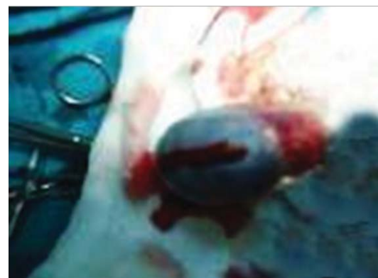
Fig. 1 B: Early surgical exploration - tunica albuginea incised for evaluation of intratesticular hematoma.

tunica without tension. With 3 false positive cases the sensitivity and specificity of US were 80% and 79%, respectively.