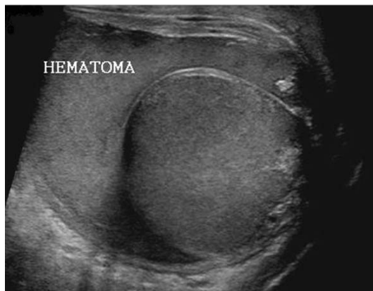
Fig. 2A: Scrotal US of blunt trauma shows mild intratesticular hematoma in a patient who underwent delayed exploration.