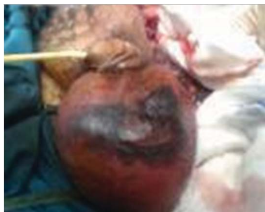
Fig. 2B: Delayed exploration with gangrenous scrotal skin.