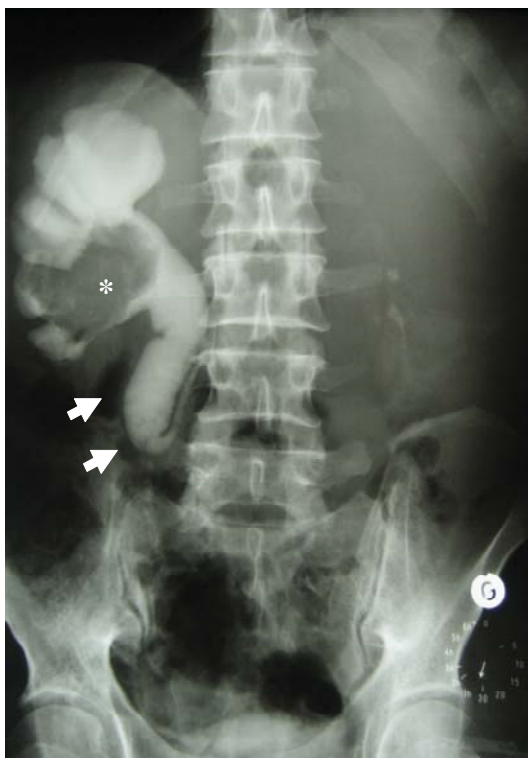
Fig. 1: IVU showing a J-shaped deformity of the dilated proximal right ureter with hydronephrosis and filling defect in the renal pelvis.

where the ureter passed behind the vena cava. On histopathologic examination the bladder and ureteral tumors were classified as TCC, stage pT4a N0 M0 and pT2 N0 M0, respectively.