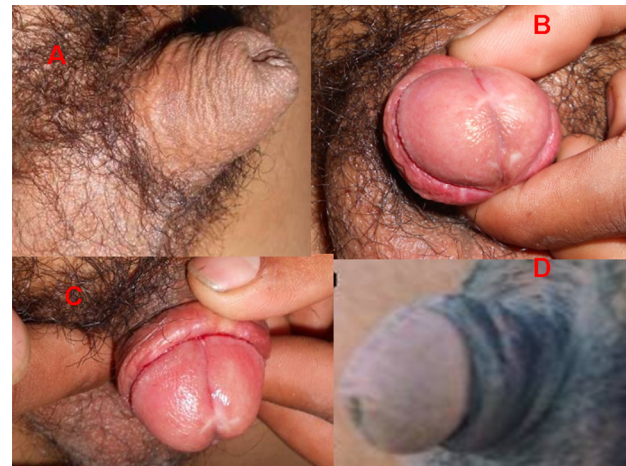
Fig. 3 (A) Post-operative photograph showing straight penis with normal looking prepuce pre after epispadias repair with preputioplasty. (B) Normal glans with slit like opening prepuce. (C, D) Normal looking glans and adequate length of penis.

Age of the patients varied from 6 months to 26 years with a mean of 9 years. Patients were grouped according to type of epispadias into glanular (2 cases), penile (17 cases) and penopubic (24 cases). In penopubic variety out of 24 patients, 2 (8%), 14 (58%) and 8 (34%) had mild, moderate and severe chordee respectively, Six patients (25%) had mild torque with 5 of them towards right and only 1 towards left, one patient (4.16%) had moderate torque which was towards right. Twenty one (88%) patients had excellent cosmetic outcome with complete correction of chordee/torque, however two (8%) patients had residual chordee and 1 (4%) patient developed torque after the procedure. Though the penile length was not measured but penile length was recorded with in normal range as per age