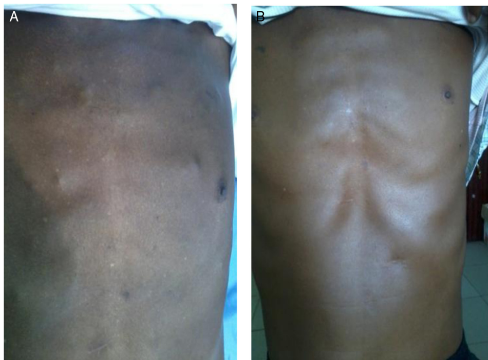
Figure 2 Skin metastatic nodules (A) which disappeared one month after the androgen deprivation therapy (B).

So the patient has been referred to urology for management. He presented to our clinic in urology four months after he had been seen in dermatology. On examination the nodules had spread on the entire chest and the abdomen. He lost weight and was unable to go to work. He did not have lower urinary tract symptoms neither hematuria, nor back pain. There was no illness in the patient history and no prostate cancer disease in the family. On digital rectal examination (DRE), the prostate was enlarged, hard and nodular. His new serum PSA was 96 ng/mL. A diagnostic prostate biopsy (12 cores) revealed a high-grade (Gleason grade 4+4) adenocarcinoma on hematoxylin and eosin section. A CT scan of the chest, abdomen and pelvis revealed no widespread visceral lesions but pelvic lymph nodes dissemination. The bones scintigraphy was not performed because it was not available in the country. So the prostate adenocarcinoma with skin