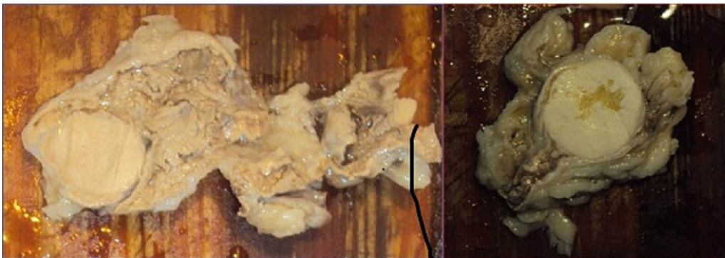
Figure 3 Macroscopic pathological image showing macronodular adrenal hyperplasia.

A 12-year-old boy referred to our clinic from endocrinology department with the diagnosis of CS. His CT showed a small 8 mm right adrenal adenoma (Fig. 4). Laparoscopic right adrenalectomy was done. Pathological assessment confirmed the diagnosis of unilateral macronodular hyperplasia.