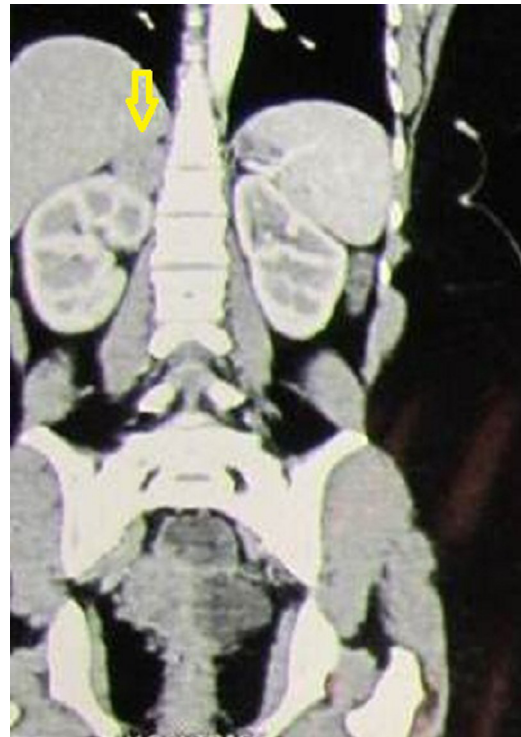
Figure 2 CT image showing adenoma in right adrenal gland.

A 49-year-old male patient presented with severe persistent headache over 4 years, started with the diagnosis of hypertension not responsive to antihypertensive measures, with frequent admission to intensive care with malignant hypertension. His laboratory tests showed hypokalemia (serum potassium was 2.1 mEq/L). Serum aldosterone was high (31 ng/dL). Reference range 3–19 ng/dL and aldosterone renin ratio (ARR) was 25. CT abdomen and pelvis revealed a small nodule (7 mm) in left adrenal gland that had an initial attenuation of 2 Hounsfield unit and was diagnosed by radiologists as a small lipid rich adenoma (Fig. 1). We counselled the patients and did laparoscopic left adrenalectomy and the pathological assessment revealed macronodular adrenal hyperplasia. The patient was cured and his blood pressure was stable requiring no antihypertensive measures.