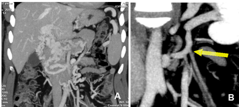
Figure 2 (A) Abdominal contrast enhanced computed tomography scan (coronal view), in the portal venous phase depicting the underlying portal-systemic shunt. Multiple collateral vessels are also present. (B) Coronal venous reconstruction demonstrating the left testicular vein (yellow arrow) draining via the retroperitoneal collateral system to the left renal vein.

Patients with underlying portal hypertension and a porto-systemic shunt rarely present with a right-sided or bilateral varicocele. A Pubmed search (with cross referencing) using the search terms; 'varicocele AND portal hypertension' and 'varicocele AND porto-systemic shunt' only revealed the following four previously reported cases (Table 1) [1-4].