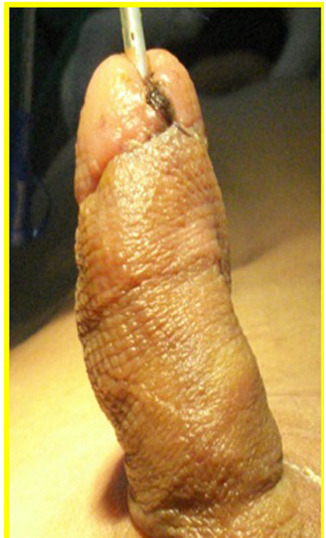
Figure 6 Result on postoperative day 7.

Management of HTS requires a high index of suspicion and early intervention. The causative agent (hair) should be removed promptly to avoid further damage. Useful techniques are the unwrapping technique, the blunt probe cutting technique and the incisional approach. Depilatory creams may also be used, if access to the band of hair is limited due to edema. Once the constricting band is removed, attention must be directed toward the urethra and, depending on the severity of the injury, either end-to-end urethroplasty or URAGPI may be utilized. Using URAGPI, the urethra may be mobilized up