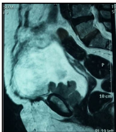
Figure 1 Multiplanar MRI showing recurrent tumor inside the neobladder.