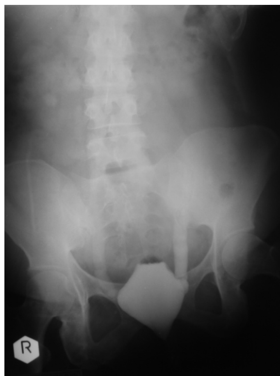
Figure 2 MCUG showing grade III reflux.

The bladder was very thick-walled with an edematous and inflamed mucosa. A generous amount of this inflamed bladder wall was excised in the hope of relieving the symptoms and was sent for tissue histology and both fungal and AFB cultures. The stone was treated endoscopically at the same time. Bladder histology showed ulceration and a severe degree of chronic non-specific cystitis, but