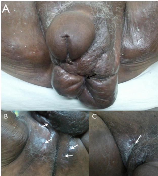
Figure 1 (Panel A) Scarring (black arrow), inflammation, and disfigurement of scrotal skin, (Panel B) multiple urethrocutaneous fistulae (white arrows), and (Panel C) purulent discharge from fistula.