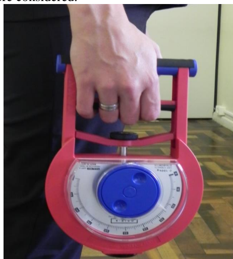
Figure 1: Illustration of the handgrip test

Volunteers were informed that they should wait for the evaluator's command to start performing each maximum gripping movement. They performed three repetitions of maximum strength contractions using the right hand and another three using the left hand. For the statistical evaluation, the average of the three measurements of each hand, before and after the intervention, were considered.