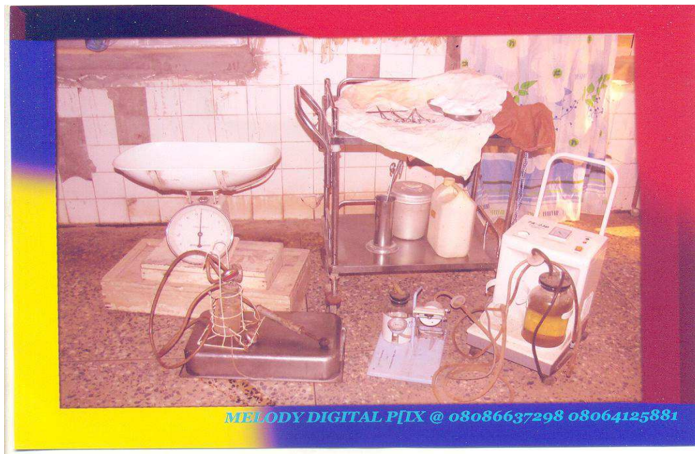
Fig 3 EQUIPMENTS FOR SYMPHYSIOTOMY PROCEDURE, SACRED HEART HOSPITAL, OBU DU

also given. The patient is nursed on a low level bed with the indwelling urethral Foley's catheter for four days with both lower limbs strapped together. Mobilization with the aid of crutches begins on the 5 th day post-procedure or when the catheter is removed. This however depends on the ability of the woman. The patients were normally discharged by the 7 th post-operative day, but some patients may stay as long as 10-14 days if the urine is blood stained or the mobilization has been deemed inadequate. The women were advised to avoid wide abduction of the thighs postpartum for about 3-6 months, avoid heavy lifting and fetching water, climbing hills etc, and to seek early hospital appointment if there is difficulty or pain on walking.