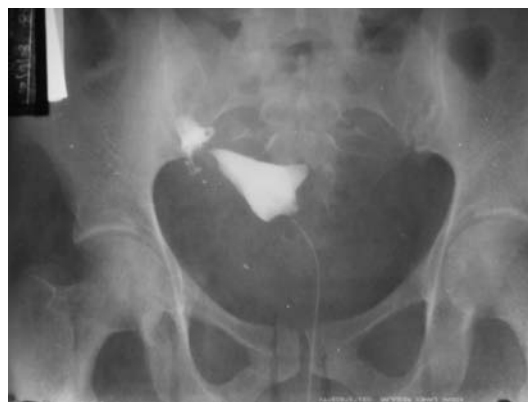
Figure 1: Initial HSG film showing contrast loculation in the right fallopian tube.

HSG was done under normal sterile procedure using non-ionic contrast (iohexol 300mg). Following initial injection of about 8ml of contrast, a moderate capacity uterus with regular margins was opacified (figure 1). The left fallopian tube was not opacified at all. The right fallopian tube was visualized with a triangular loculation of contrast in its distal aspect. This lead