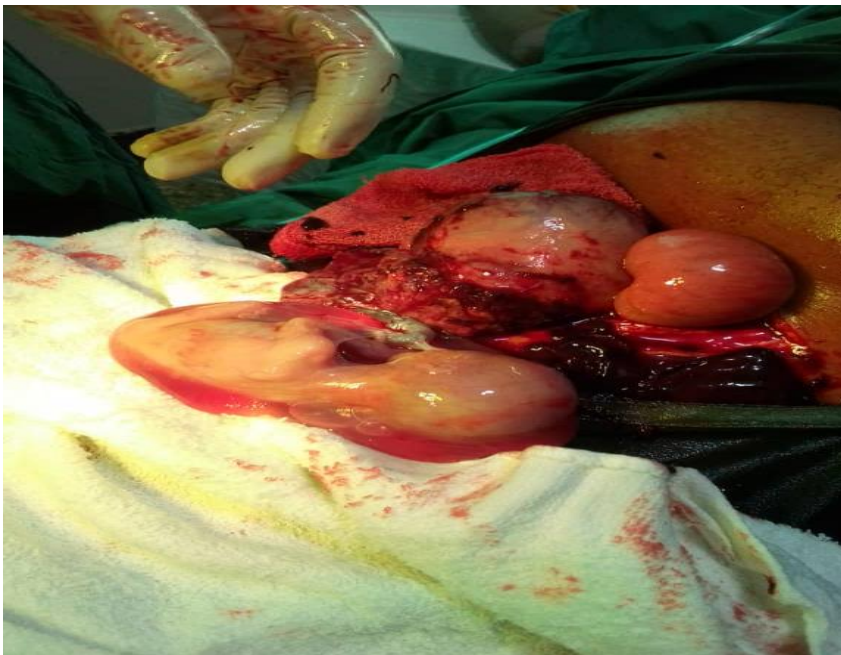
Figure 2: Extraction of the baby and removal of the placenta