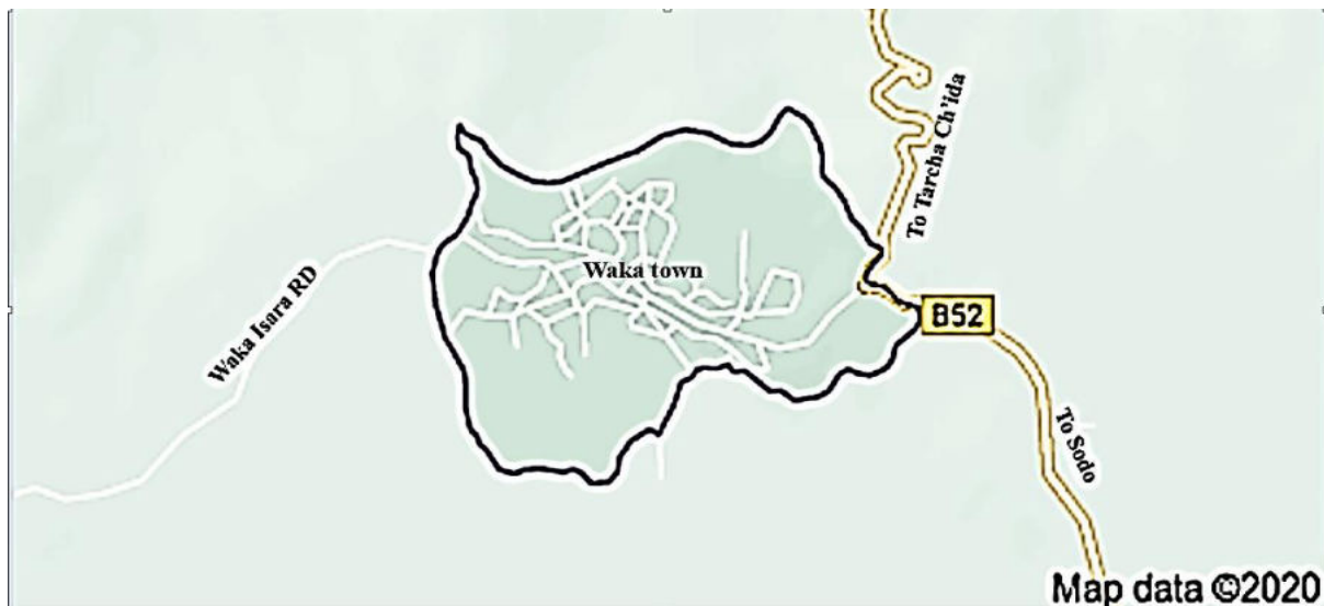
Figure 1: The map of the study site

Equal chance of involvement with random selection ensured from the beginning until the final steps. For more clarification you can see Figure 1.