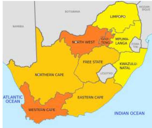
Figure 3: Levels of internal migration by province in South Africa, 2016 community survey

Internal migration levels by province are shown in Figure 2. Between the years 2007 and 2016 internal migration decreased in the Northern Cape, Mpumalanga and Limpopo while it rose in the Western Cape, Free State and Gauteng. Figure 3 shows internal migration levels across provinces of South Africa for 2016 with lighter provinces having lower internal migration and darker areas having higher levels. Highest levels of internal migration in 2016 were seen in Gauteng, the Western Cape and North West while lowest